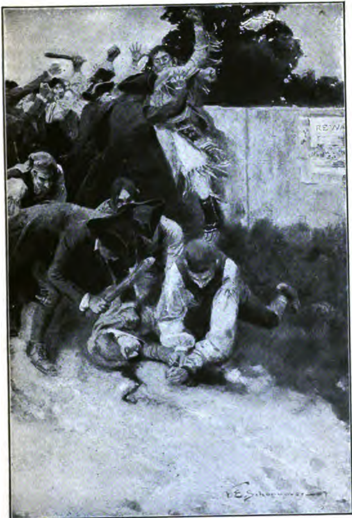
“DEATH TO THE HIGHWAYMEN”